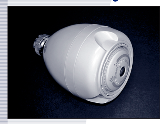
A low-flow showerhead is one of several water-conservation devices available for free at Casitas' main office in

A record low rainfall this year is already causing higher water demand on Lake Casitas. The more all water users in Western Ventura County conserve water the more likely the limited local water supplies can be extended throughout a long-term drought, and future water rationing avoided.