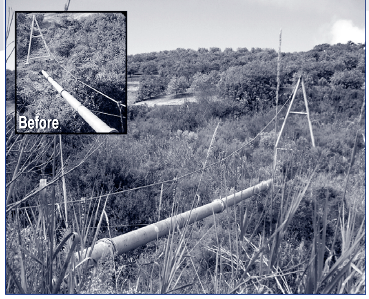
was stripped of old paint and repainted to protect it from rusting.