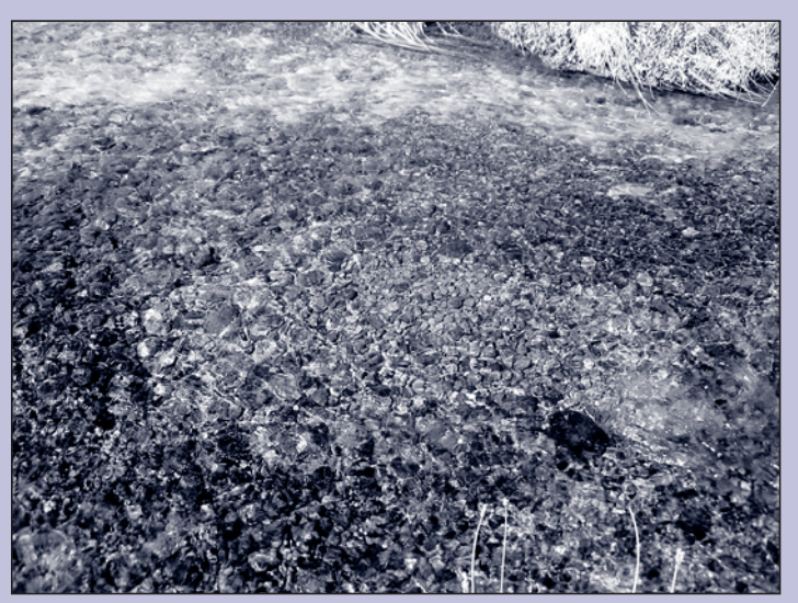
A redd (the lighter colored gravel area in the center of photo): A spawning site for steelhead or rainbow trout that was recently found in the San Antonio Creek.

It takes four to eight weeks, depending on water temperature, before the eggs will hatch. Steelhead will and spawn when they become adults.